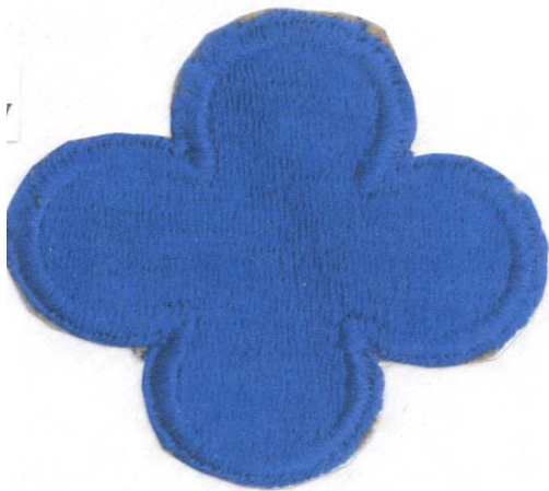
Patch of the 88th Reserve Support Command (RSC), later Regional Readiness Command (RRC)