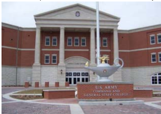
Command & General Staff College