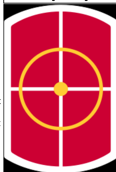
420th Engineer Brigade